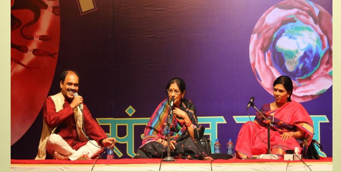
Honorable Kishoritai in conversation