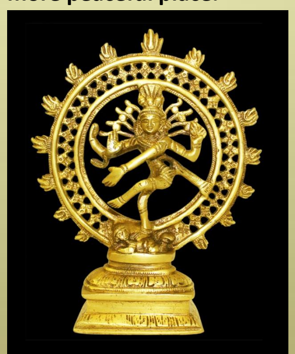
Our Details: www.muktajoshi.in www.facebook.com/nrityadharain stitute