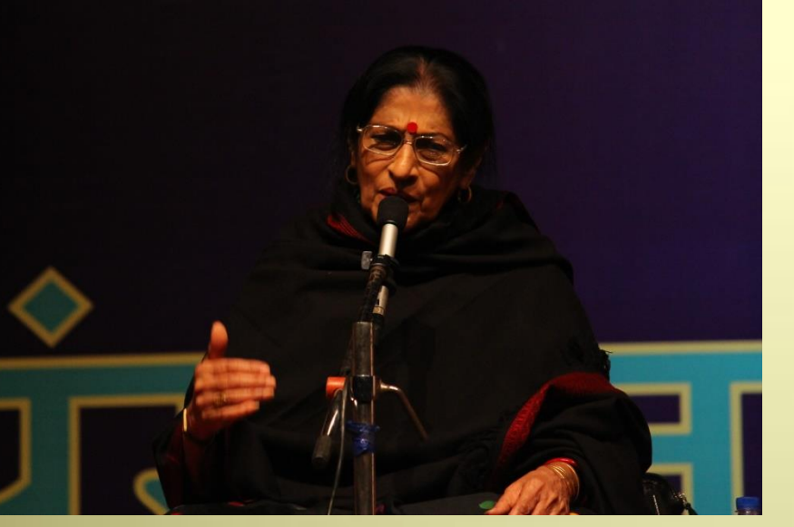
Gaansaraswati Kishoritai Amonkar In an open conversation with audience